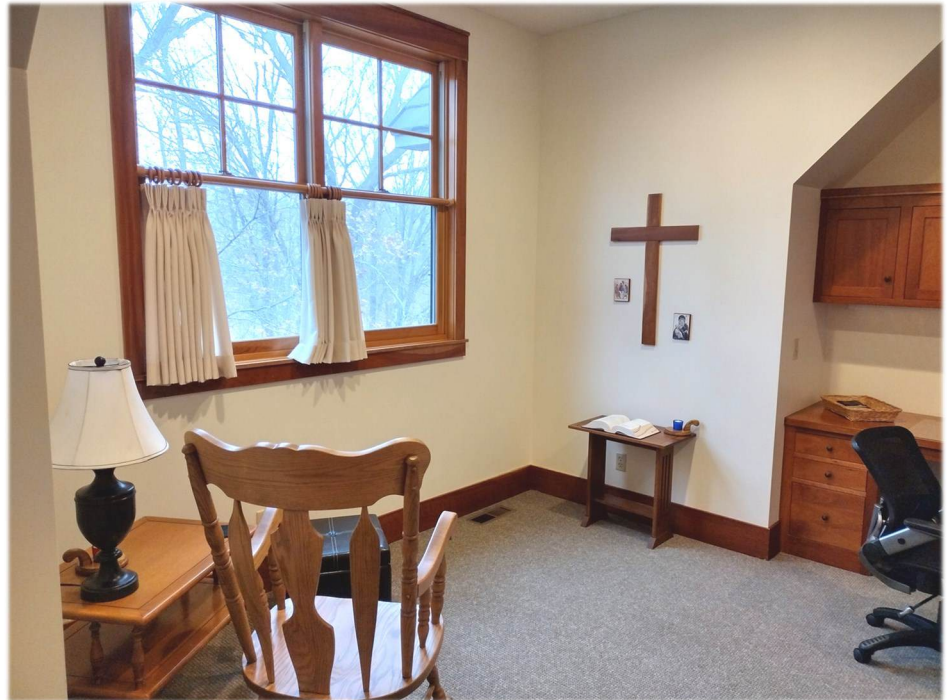
The interior room of St. Gabriel is located upstairs inside the Our Lady of Pacem building.

During July and August, a priest of the Archdiocese of St. Paul and Minneapolis will be in residence, utilizing the space and offering Mass as available.